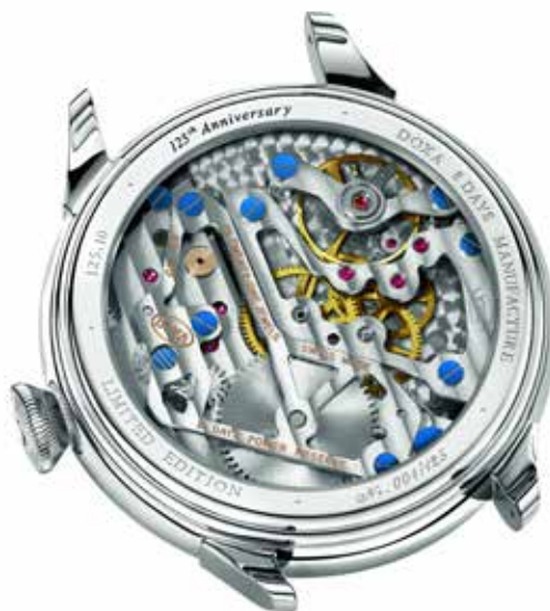
Movement Doxa 8 Days Manufacture

Gents Size: 57 mm Movement: 8 Days Mechanical 125 with Power Reserve Case: 10 Micron Rose Gold Plated Crystal: Sapphire Dial: Opalin Open, Arabic Index Water Resistance: 30 m Bracelet / Strap: Brown Genuine Alligator Leather Limited Edition: 125 pcs